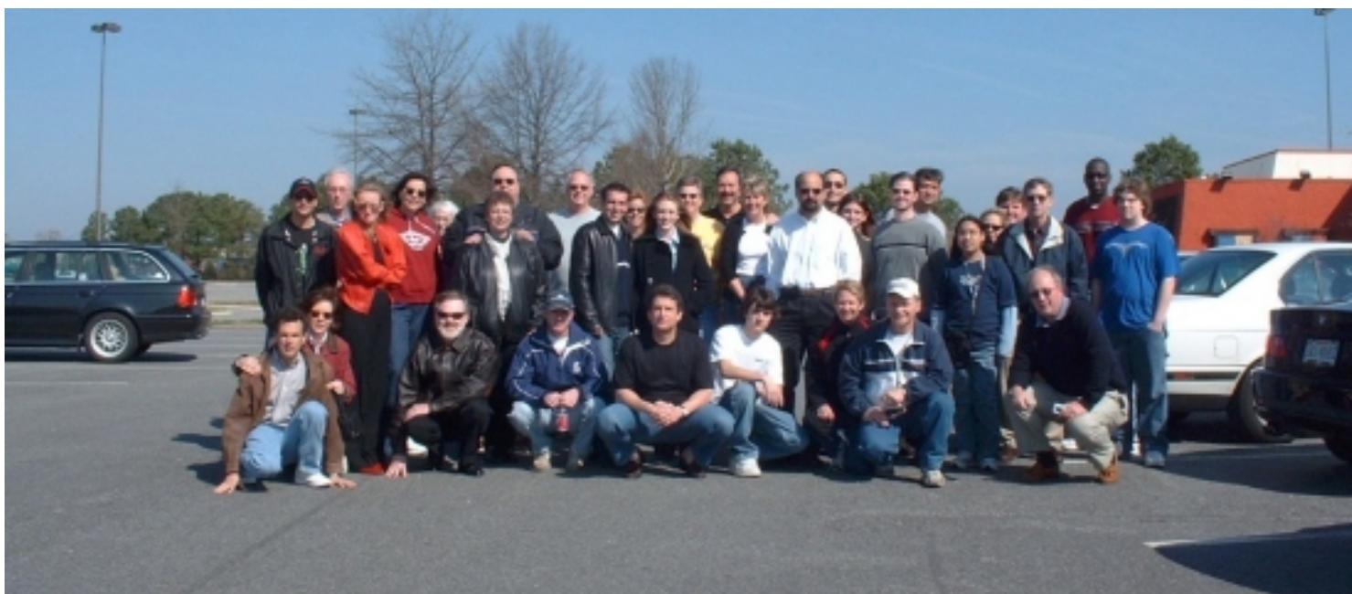
March 20th Fun Rally — Notice how well the teams get along BEFORE the rally?