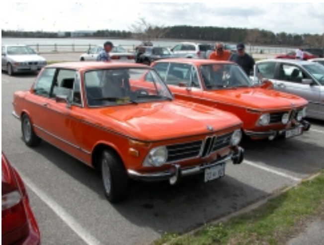
Great, now they are multiplying !!