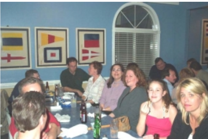
Lots of smiling going on.