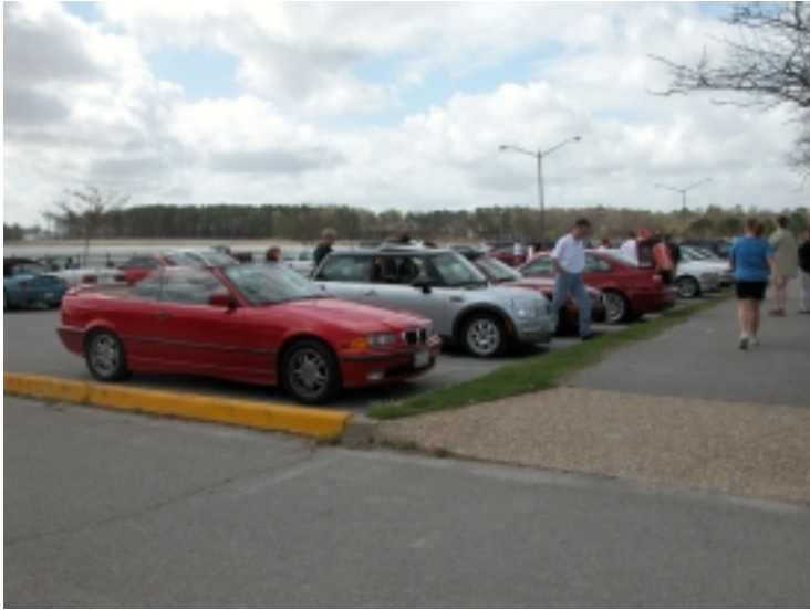
Rally cars lined up.