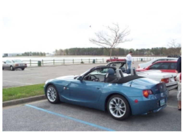
The first of the Z4's show up at our events!